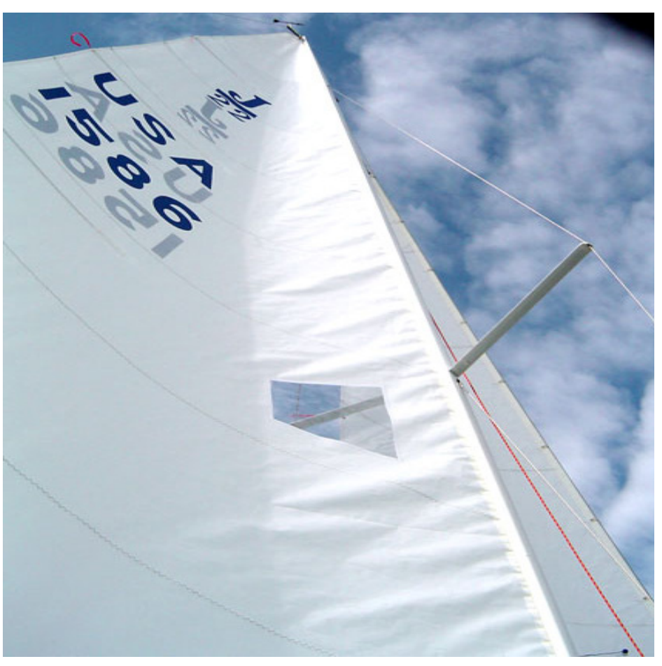
Maintain an eased luff tension in light winds.

The backstay turnbuckles should be adjusted according to conditions. Ease the turnbuckles in light air so the backstay has no tension and the backstay blocks ride just below the connector plate. A small piece of shock cord can be used to help hold the blocks up closer to the connector. This cord is attached from the deck through a block on the connector plate and then back to backstay bridle blocks. As the breeze increases, tighten the backstay turnbuckles in relation to the uppers and lowers to allow for maximum adjustment. Remember that, just like shroud tension, the backstay turnbuckles cannot be changed after the preparatory signal.