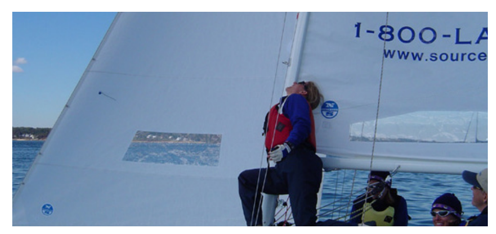
Sight the sag in the mast by sighting up the back of the mast when sailing upwind.

The lower shroud tension is checked by sighting up the slot in the back of the mast (lay your head on the windward side of the mainsail facing forward and looking up the mast groove). There should be a slight sag (approximately ½" to 1½") to leeward at the spreaders in all conditions except very breezy ones (20 knots and above) when heavy boom vang tension is used. Only in these very breezy conditions will the mast become almost straight. Never, in any condition, should the mast bow to windward at the spreaders! You'll have the most sag in very light air and the least sag (almost straight) in 20 knots and up.