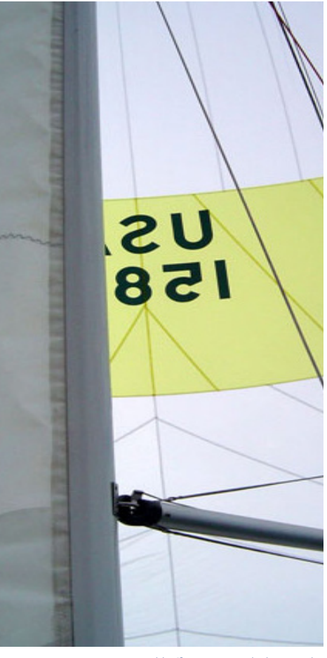
Maintain an eased luff tension in light winds.

The jib should be down on a downwind leg except in survival conditions when the concern is that you won't be able to get enough tension back on the halyard at the leeward mark. If this is the case, leaving the jib up and very eased, almost luffing, is not going to slow the boat.