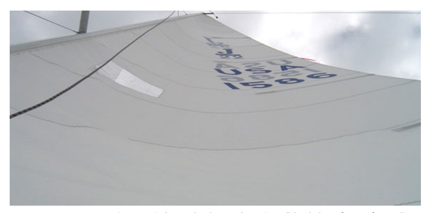
Trim your mainsheet so that the upper batten is parallel to the boom for 75% of your sailing.