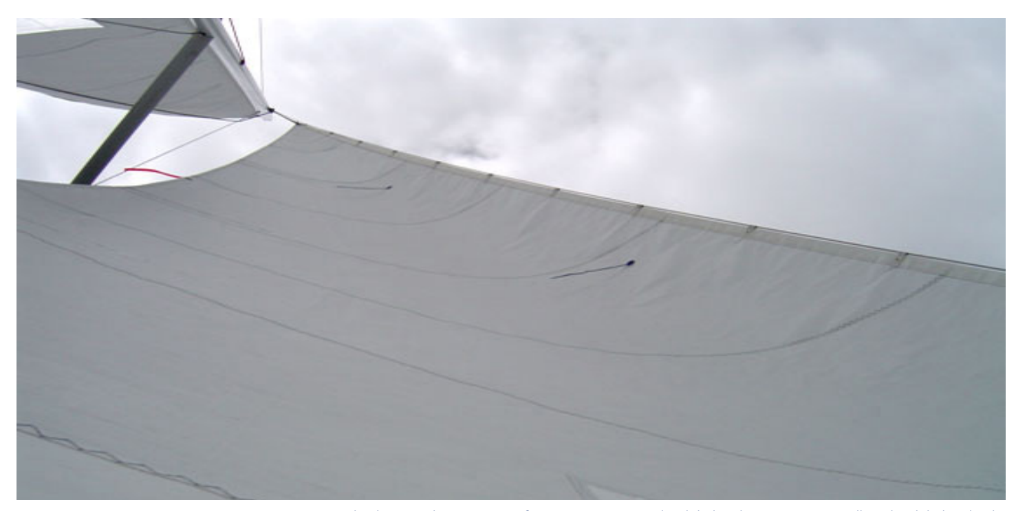
Like the main, be conscious of not over tensioning the jib halyard. However, never allow the jib halyard to be eased enough that there are scallops between the snaps. There should be slight wrinkles off each snap but they should not be extreme.

breezy conditions, ease the sheet for more twist in the leech. Generally speaking, the jib leech telltale should be flying but just about to start stalling. In the bigger breeze, however, this telltale will be less likely to stall because the jib is eased. Note that trimming the jib harder for short periods of time (where the middle batten is slightly hooked to windward of parallel to the centerline) is only effective in "ideal" boat-speed conditions (medium winds and flat water) because it narrows your steering "groove."