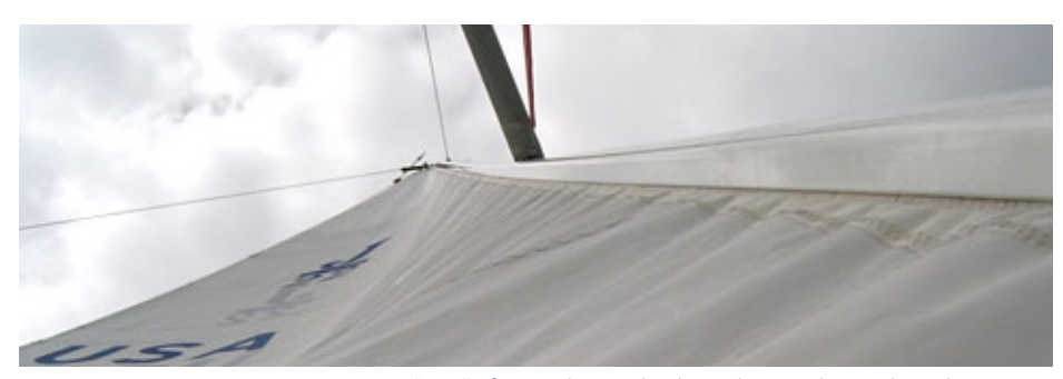
1"-3/4" of sag to leeward indicated proper lower shroud tension